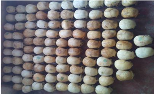
Figure 1. Showing 100 dry adult human skull bones.